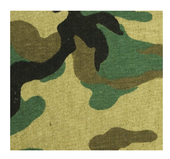
Alabama Military Installation Meeting Planned.

The first grant provided the City of Huntsville funding for a joint land use study of Redstone Arsenal and its contiguous boundaries with multiple municipal and county jurisdictions that started in 2017. That was followed by an implementation grant to TARCOG