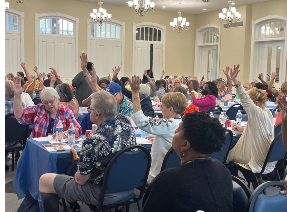
Attendees at TARCOG's Fraud & Scam Summit 2025 responding by raising their hands to say they learned something valuable at the Aug. 20 event.

Read more and watch videos from the event